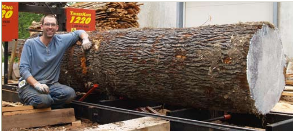
Learn what it takes to turn logs like this cherry log into lumber.